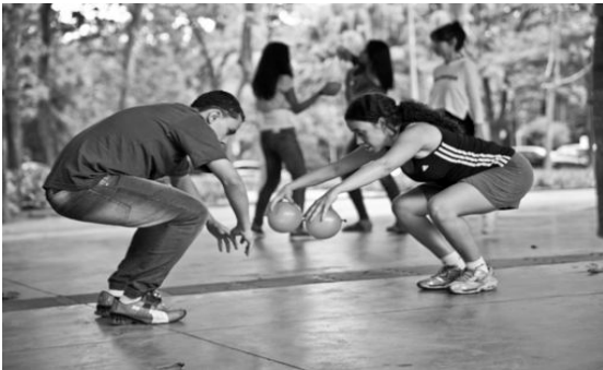
Movement Workshop – MAM Sao Paulo, April 2014