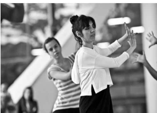
Movement Workshop – MAM Sao Paulo, April 2014