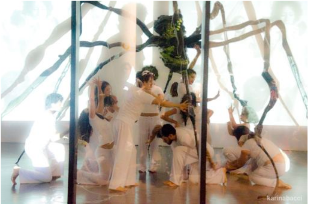
performance at the MAM Museum of Modern Art of Sao Paulo (April 2014)