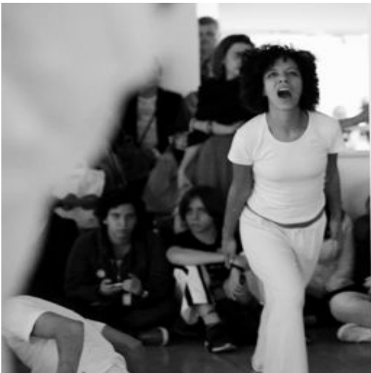
performance at the MIS Museum of Image and Sound of Sao Paulo (April 2014)