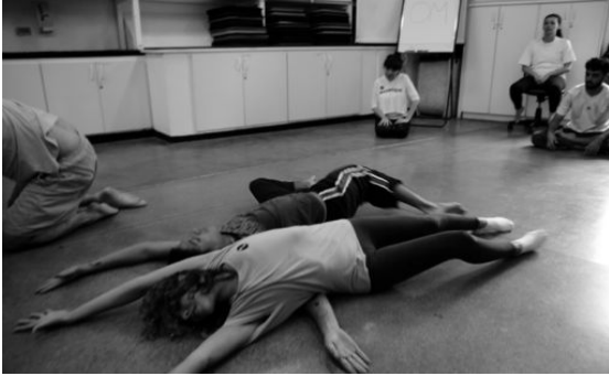
Movement Workshop – MAM Sao Paulo, April 2014