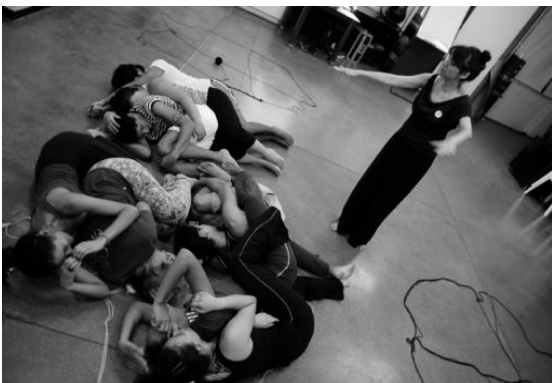
Movement Workshop – MAM Sao Paulo, April 2014