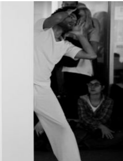
performance at the MIS Museum of Image and Sound of Sao Paulo (April 2014)