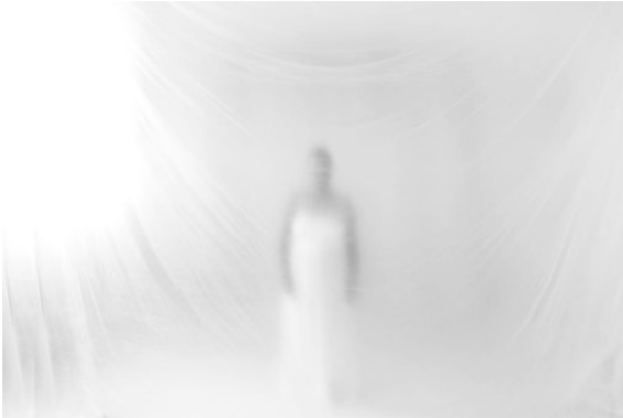
"Phonetic Fragments of One (Self)", Berlin, 2013