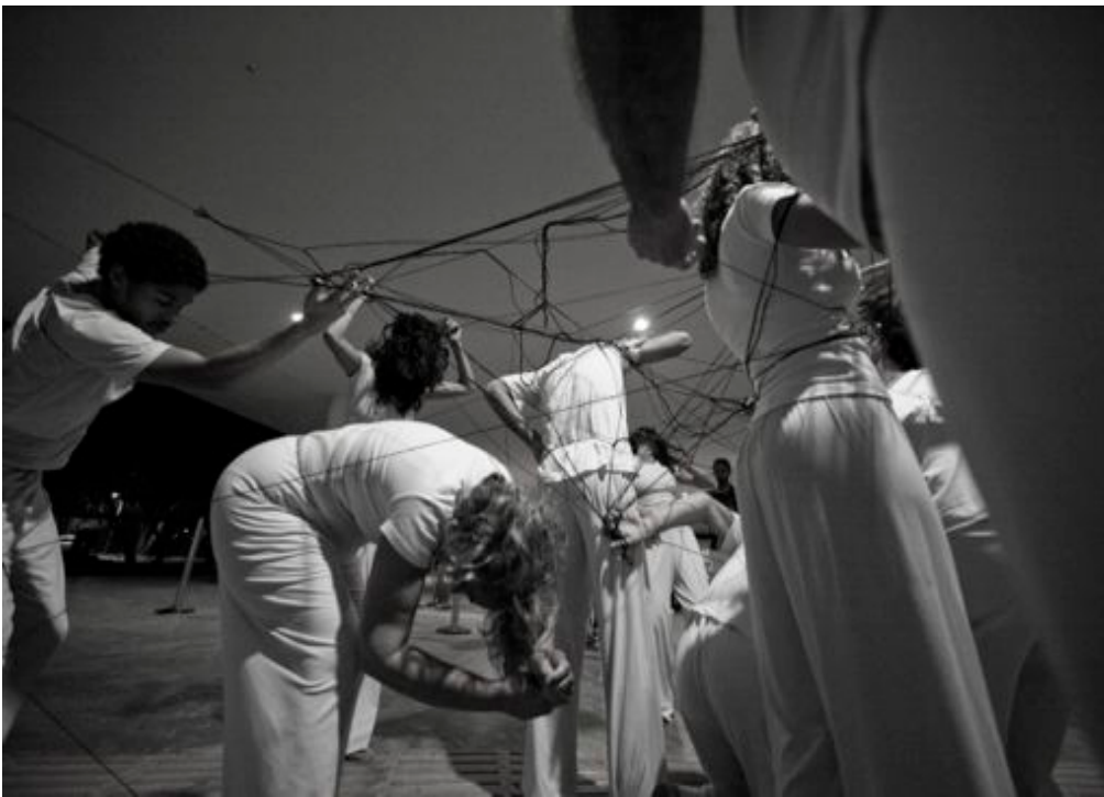
performance at the MAM Museum of Modern Art of Sao Paulo (April 2014)