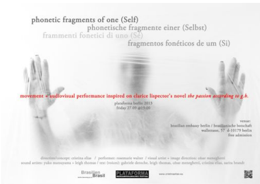
Poster - "Phonetic Fragments of One (Self)", Berlin, September 2013