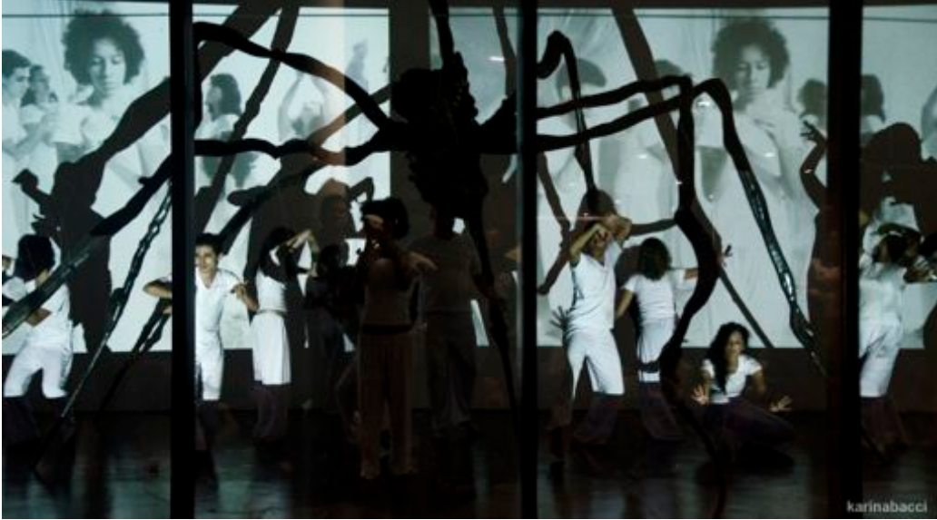
performance at the MAM Museum of Modern Art of Sao Paulo (April 2014)