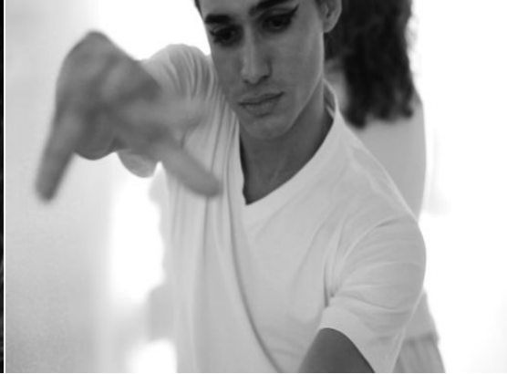
performance at the MIS Museum of Image and Sound of Sao Paulo (April 2014)