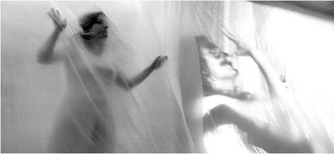
performance at the MIS Museum of Image and Sound of Sao Paulo (April 2014)