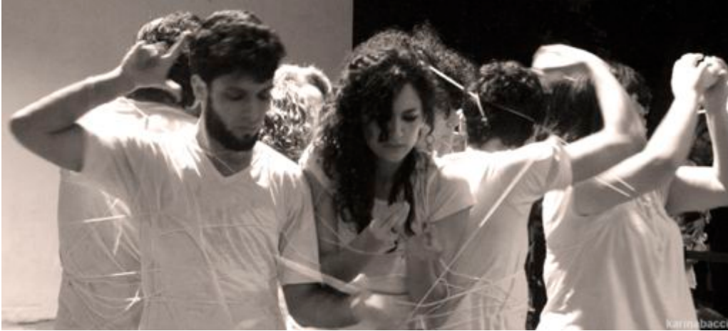
performance at the MAM Museum of Modern Art of Sao Paulo (April 2014)